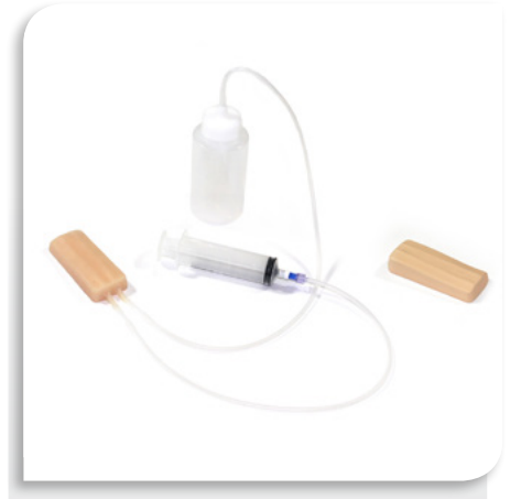
Syringe, bottle and IV injection pads