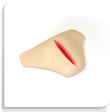
Wound care pad