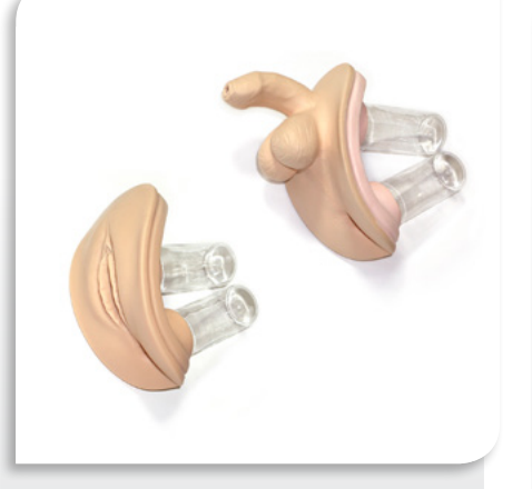
Female and male genitalia