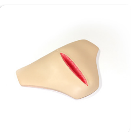
Wound care pad