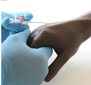
Visual inspection and palpation Gripping system provides true-to-life vein placement Ability to position the hand for life like cannula insertion