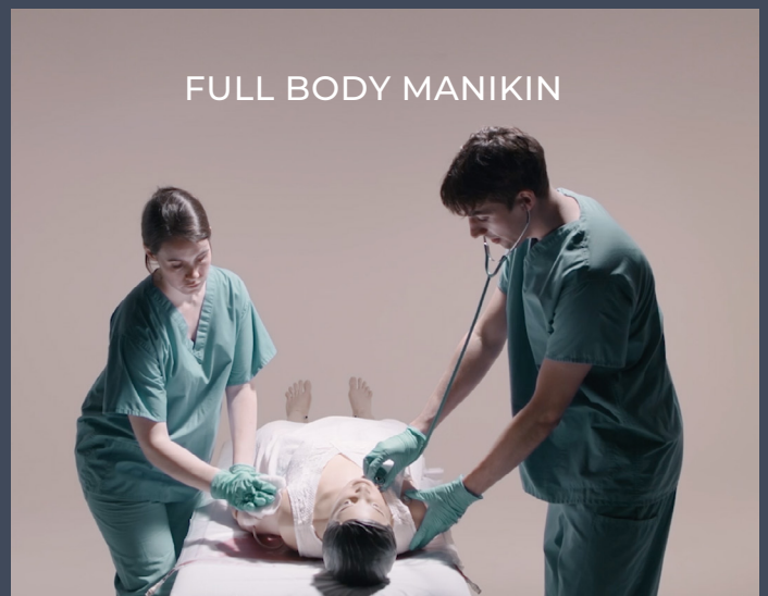
FULL BODY MANIKIN