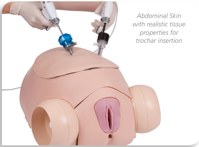
Abdominal Skin with realistic tissue properties for trochar insertion