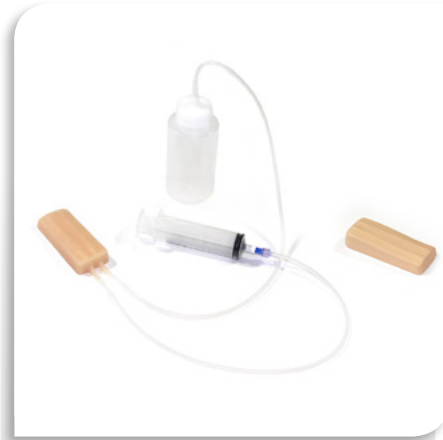
Syringe, bottle and IV injection pads