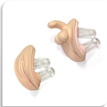
Female and male genitalia