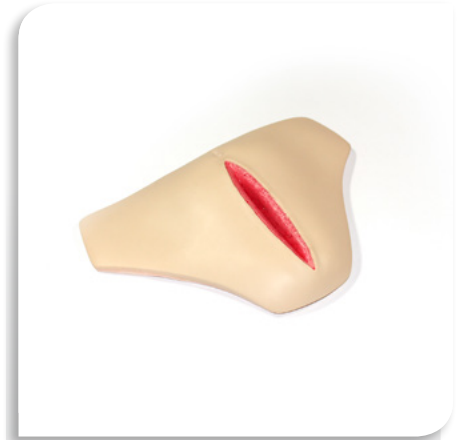
Wound care pad